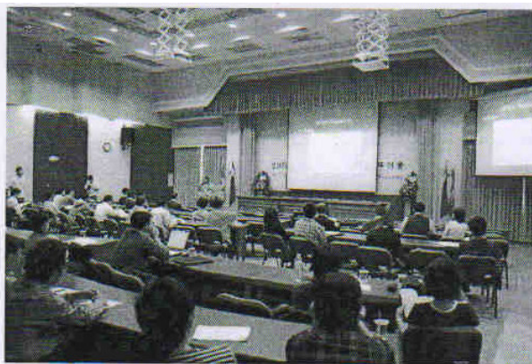
Speakers and participants at the workshop